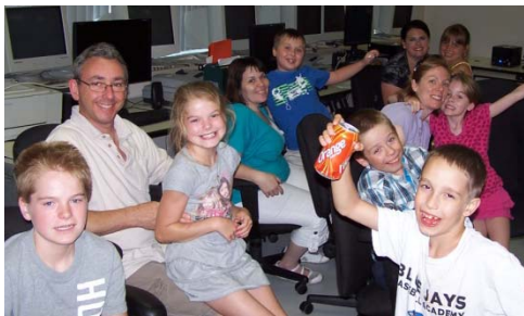
Participants in the Summer Experience program enjoyed a pizza party on the last day of camp

ATN continues to offer a full-time Skills for Employment program which includes job search, academic upgrading, life skills and computer classes. This year a total of 23 clients participated in the three SE programs that were offered. The 4-week Introductory Computer program continues to be a popular choice for individuals interested in upgrading their computer skills only. Sixty-seven clients participated in the eleven programs we offered last year.